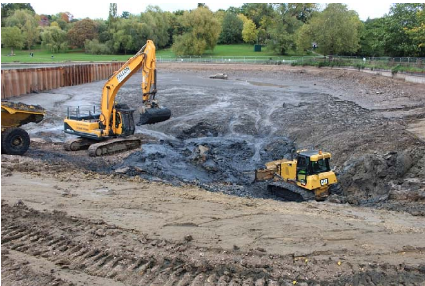
Picture 2 - De-silting Model Boating Pond using excavators