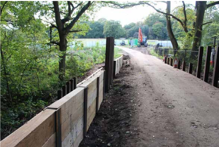
Picture 8 - An oak retaining wall is installed to raise the dam at Stock Pond.