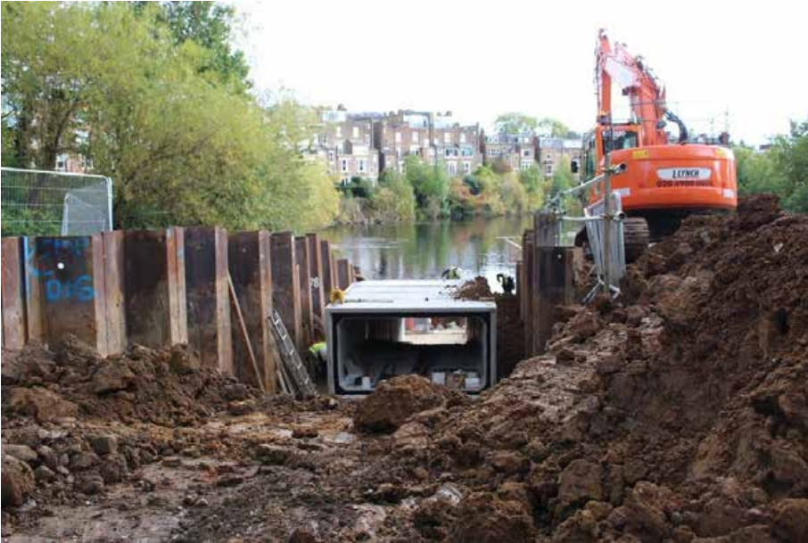
Picture 7 - Works underway building the culvert between Hampstead No. 2 and 1.