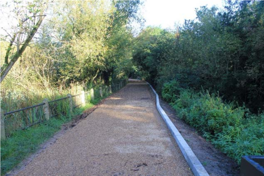
Picture 5 - Completed works at Vale of Health