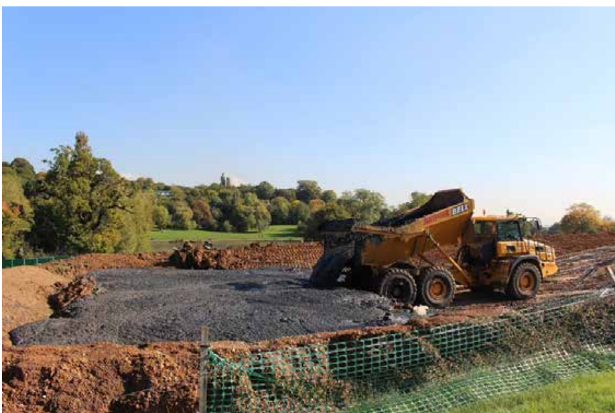
Picture 3 - Silt deposited to dry out in work compound next to Model Boating Pond.