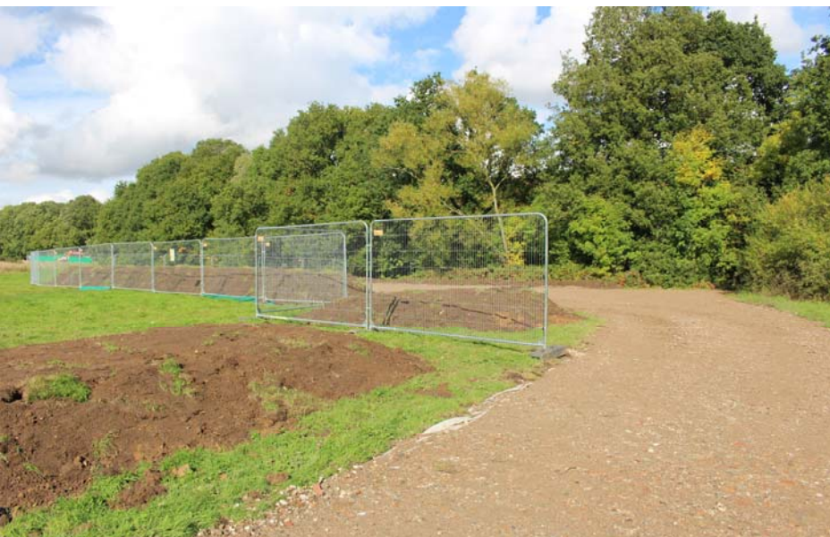
Picture 9 - Work compound and temporary access route at the back gate of Ladies Pond.