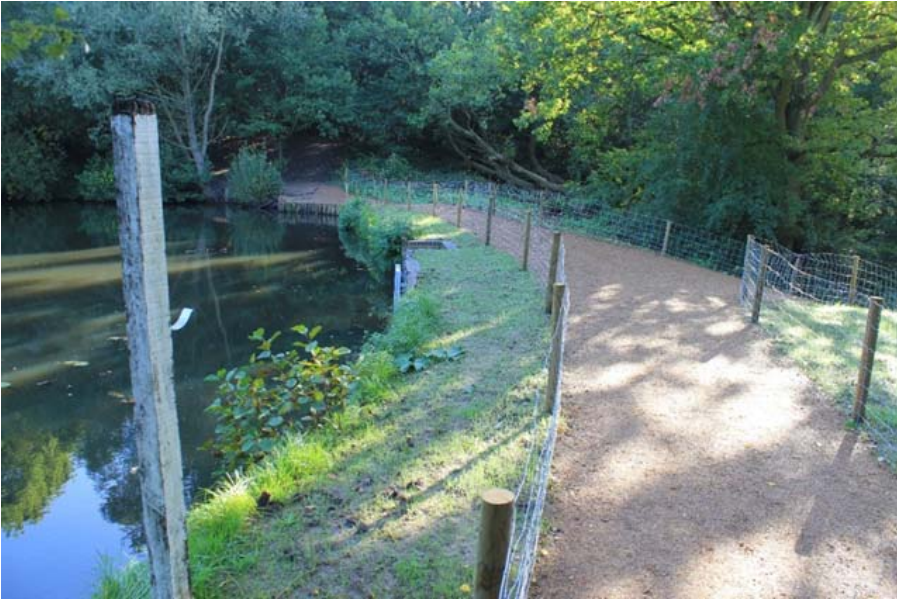
Picture 4 - Completed works at Viaduct Pond