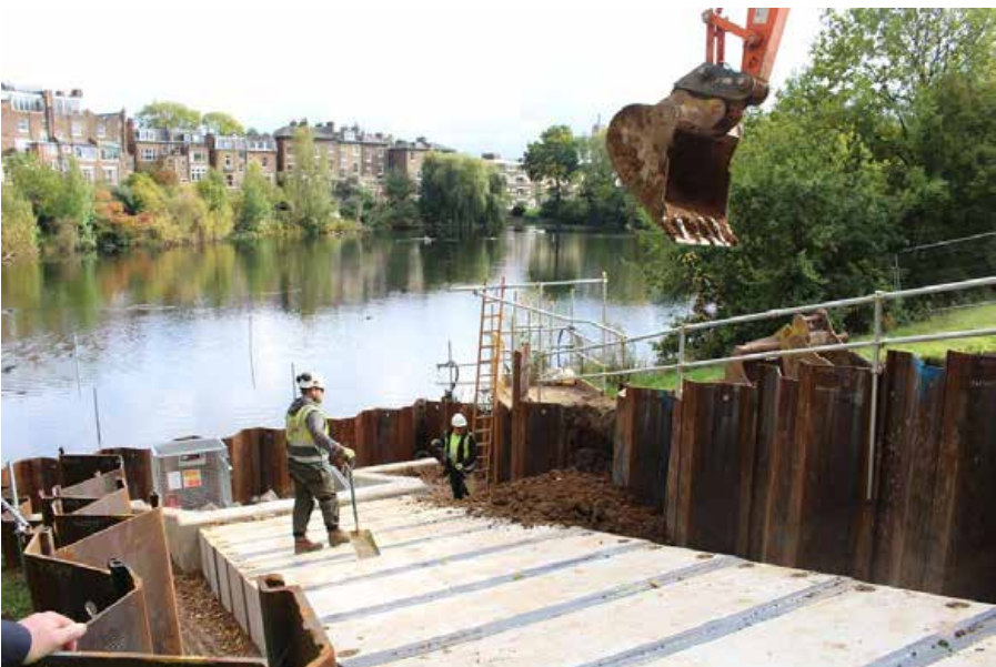
Picture 6 - Works underway building the culvert between Hampstead No. 2 and 1.